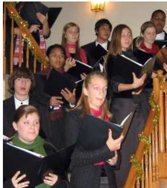
Gilroy High School Choir.